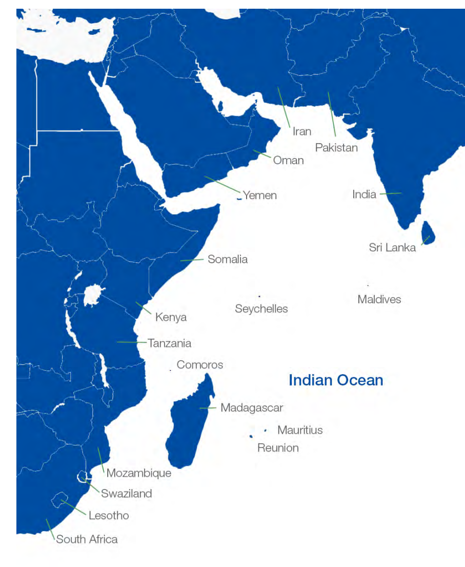
Figure 1: Map of the Western Indian Ocean